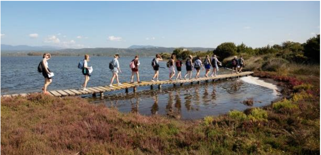
Figure 5: A group of students are visiting the Gialova lagoon.