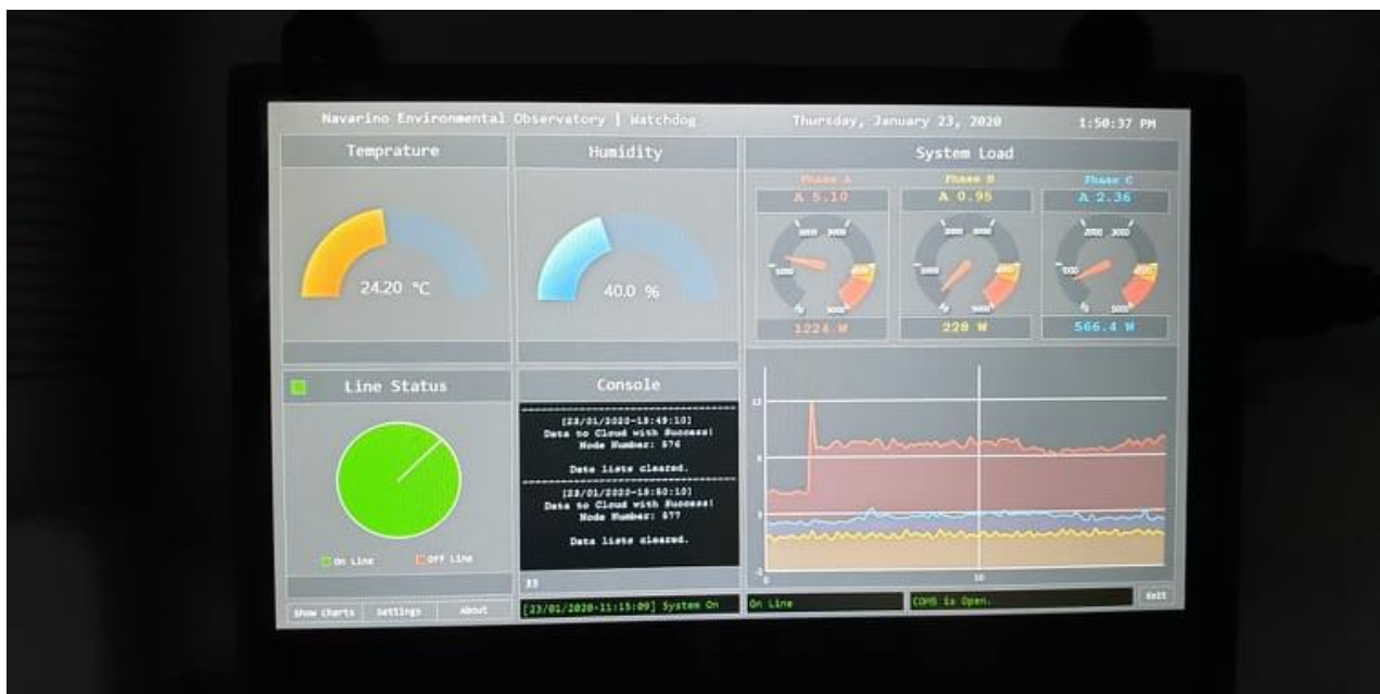
Figure 2: Watchdog screen.

Researchers from the Academy of Athens and the National Observatory of Athens visited NEO atmospheric station at Methoni in order to maintain and calibrate the O 3 and CO analyzers and to install the aethelometer. A new high-tech application (watchdog) which help us to check and control the voltage for all the instruments that are working in the station, has been installed. More specifically, it is connected to the distribution board and it measures the voltage of each phase, it records all the values and also measures temperature and humidity inside the Isobox.