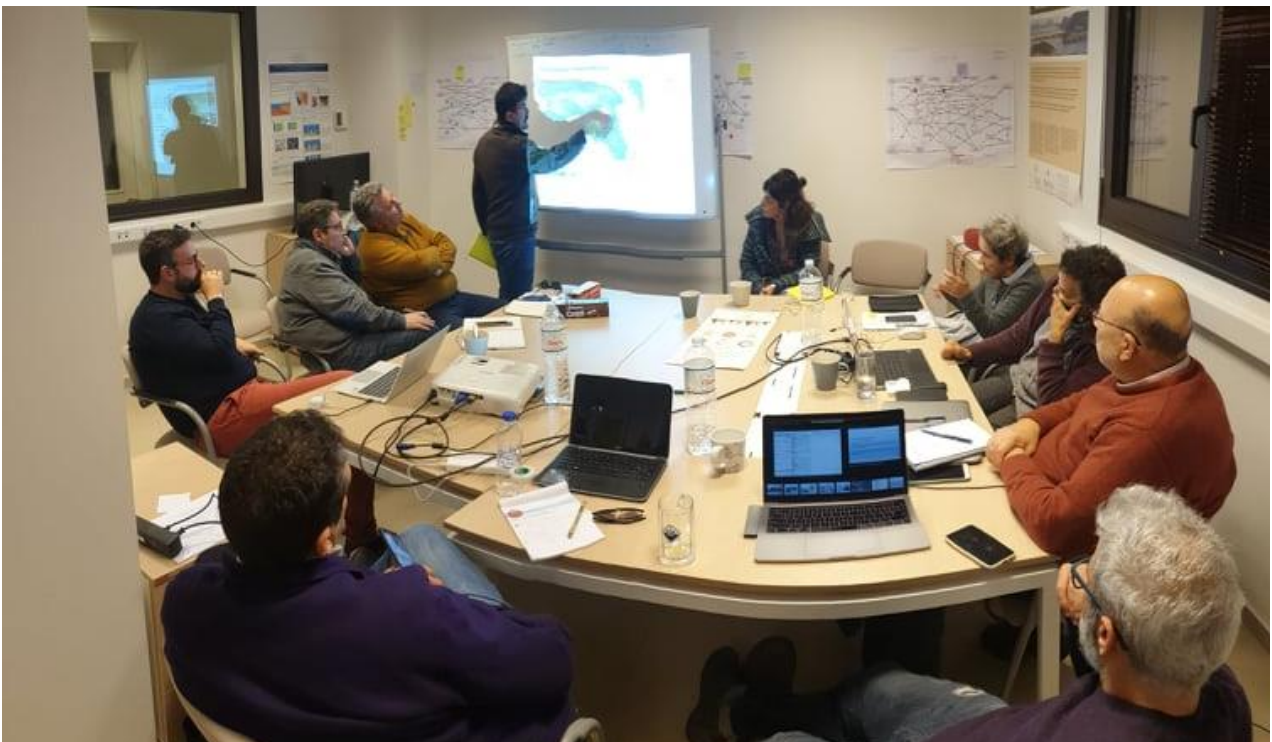
Figure 7: LTER-Greece members are identifying their future goals.

NEO is one of the partners of the Greek Long-Term Ecological Research Network, and during the period 14-16 of January a workshop, focusing on the future steps of this collaboration, was hosted at NEO.