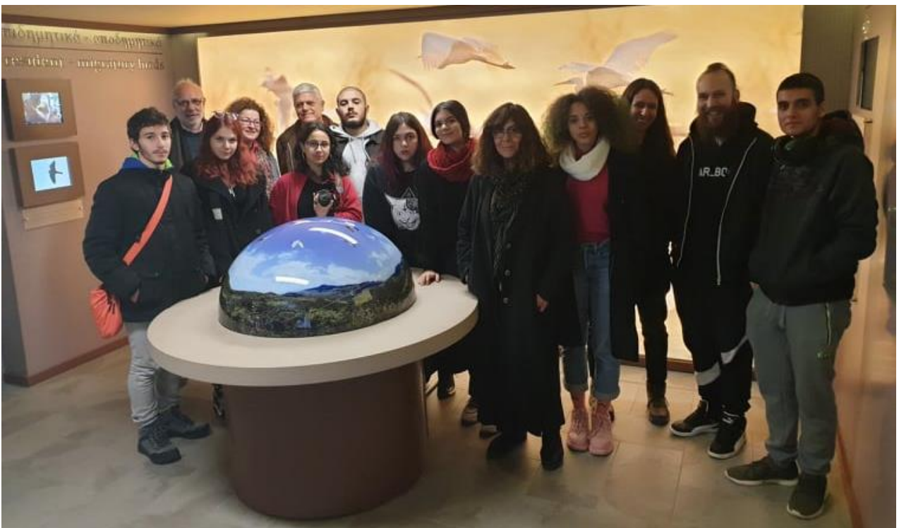
Figure 6: Sivitanidios students and ANIMA members are visiting the Natura Hall at Costa Navarino.

Sivitanidios Public School of Trades and Vocations and ANIMA, a Non-Governmental Organization for the protection of the wild life, have been collaborating under the auspices of the Captain Vasilis and Carmen Constantakopoulos Foundation. The main purpose of this collaboration is the environmental education of the students and for this reason a small group of students and some members of ANIMA visited NEO during January. On the way to NEO the whole team visited also the Stofylia National Park where they informed from the managing body about the area. The next days they visited the Natura Hall at Costa Navarino, the Palace of Nestor, the Wildlife Care and Protection Center at Gargalianoi and the Environmental Education Center of Kalamata. During their excursion they released two hawks back to the wild, one at Stofylia and the other to Messinia!