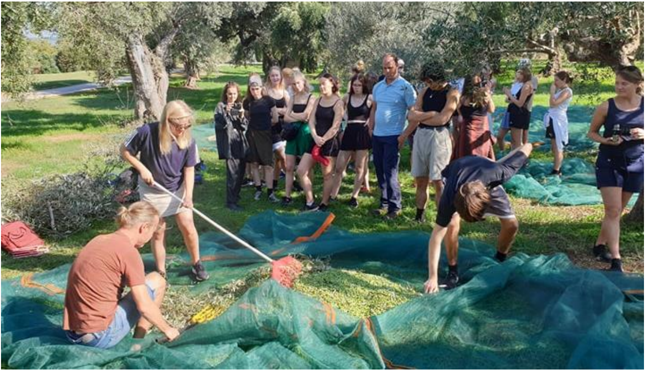
Figure 4: Students are participating at olives harvesting.

At NEO, the program was packed with excursions, primarily to the Natura 2000 protected area around Gialova Lagoon. The main objective for the whole trip was to further understand the dynamics of nature conservation. The students looked at the rules and regulations surrounding Natura 2000 and they tried to answer why it is important to protect that kind of areas. A very interesting part that they studied was the relation between local community and businesses and the study area. Most of them are directly or indirectly affected by restrictions and sometimes possibilities that comes with the Natura 2000 status. This year they really benefitted from the research of NEO manager Giorgos Maneas, and his recently published work which added new insight and context.