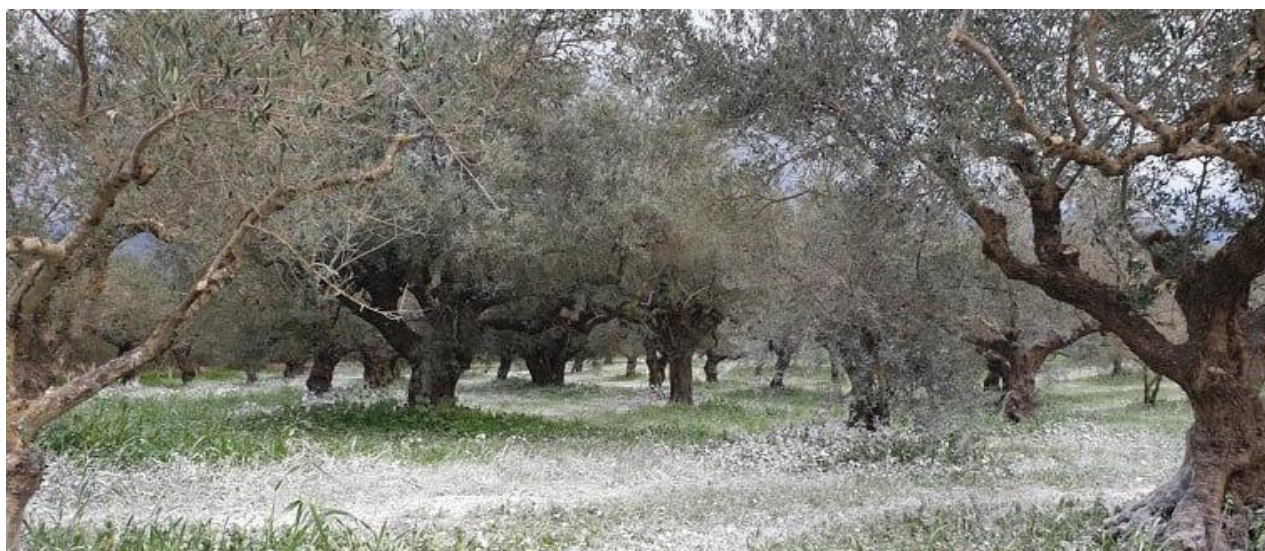
Figure 1: Farmers in Messinia using ash instead of fertilizers in olive trees.