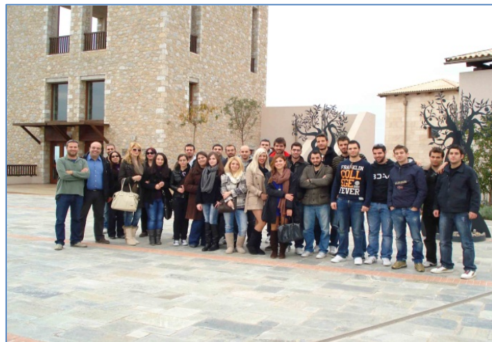
Figure 3. Students from the 1 st training course in Air Pollution at NEO