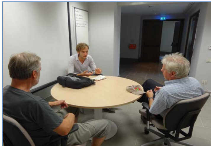
Figure 2: Visit of a Swedish journalist at NEO office at Costa Navarino